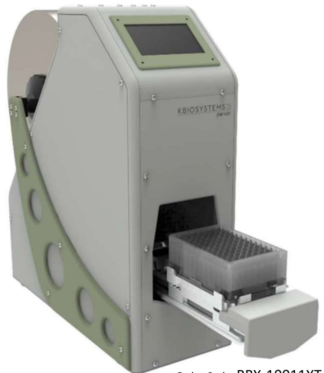
Order Code: RBX-10011XT

System operation is designed to efficiently apply a heat activated sealing film to a micro well plate or tube rack top surface. By pulling and maintaining control of a reel of film cutting to the desired length and by means of heat and time based variables apply the film to achieve the seal. The unit is both pneumatically and electrically operated and hence will require both supplies to be readily available.