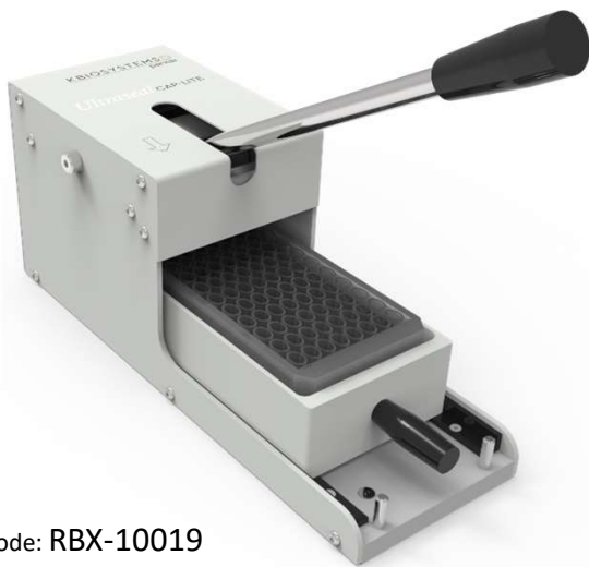
Order Code: RBX-10019

The Ultraseal CAP-LITE unit is a manual micro plate and tube rack mat cap applicator. The unit uses pre formed silicon mats or cap arrays then applied to the plate top surface to create the removeable seal on the plate. The sheets are manually placed upon the plate surface and a draw section pushed closed to once below the manual pull bar, this is then pressed down onto the cap and plate to form the seal. Plate height spacing maybe required to seal from 9mm to 48mm SBS plate and tube racks.