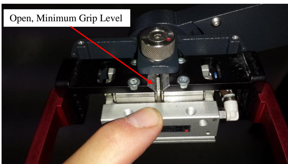
Open, Minimum Grip Level